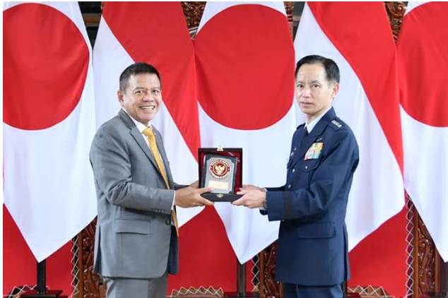
Indonesian Herindra Deputy Minister of Defense