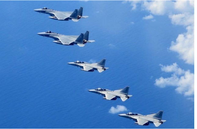
Philippine Air Force FA-50& JASDF F-15