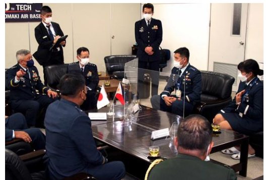
5 th Technical School (Komaki Air Base)