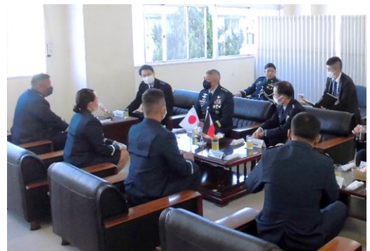
1 st Technical School (Hamamatsu Air Base)