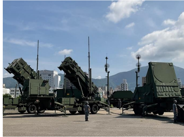
PAC-3 maneuver deployment training