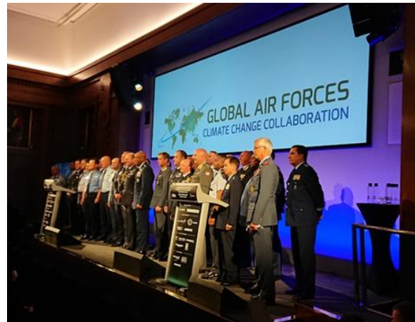
Participation in the Global Air and Space Chiefs' Conference (GASCC)