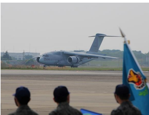
Transportation of humanitarian relief supplies for Ukraine