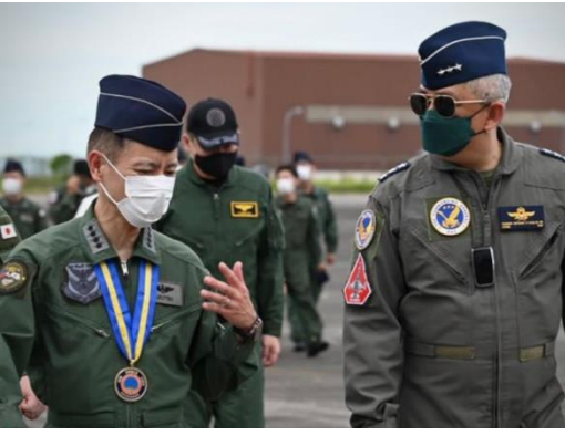
Visitation of Japan-Philippines bilateral HADR exercise