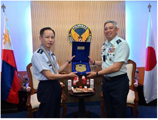
Meeting with Commanding General of Philippine Air Force