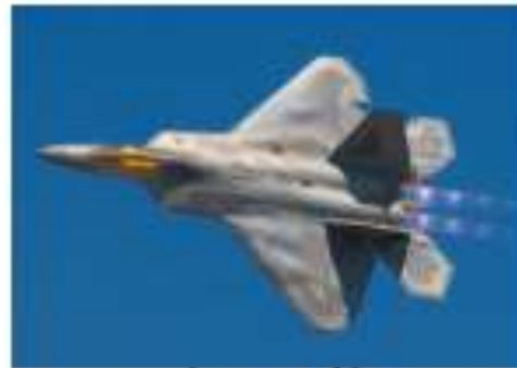
Low or No Combat Attrition