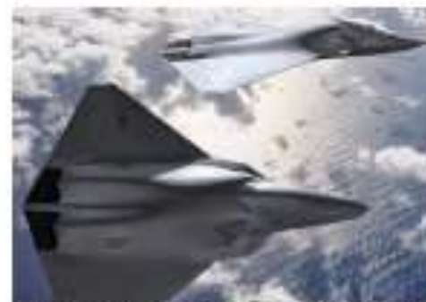
Enduring Technological Advantage

We have come to appreciate these vulnerabilities, but lag in implementing strategies to overcome them.