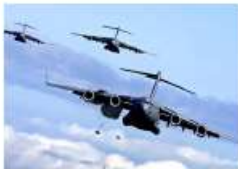
Unchallenged Power Projection