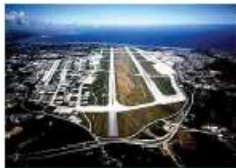
Forward Bases as Sanctuaries