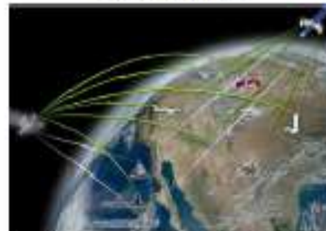
Assured, Resilient C3